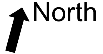
EXHIBIT HALL "C"